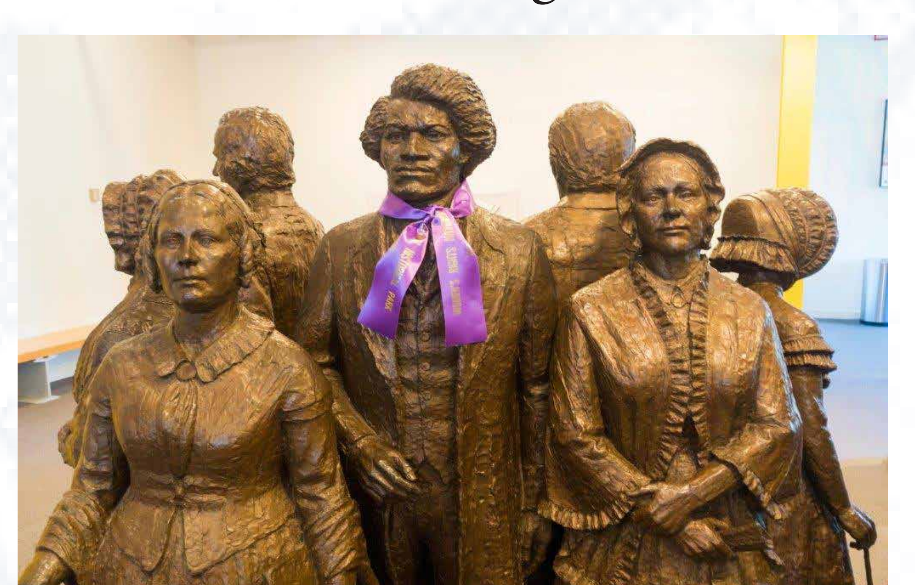
Frederick Douglass is portrayed with fellow suffragists at the Women's Rights National Historical Park in Seneca Falls, New York. Douglass participated in the first women's rights convention on this site and also spoke at the first "national" Woman's Rights Convention in Worcester in 1850.

Frederick Douglass's lifelong commitment to women's rights reflected a belief that rights should be universal, not limited by race or gender. He believed that disenfranchised groups should support each other. Douglass played a critical role in the 1848 Seneca Falls Women's Rights Convention. Debating a number of issues, some delegates thought that a