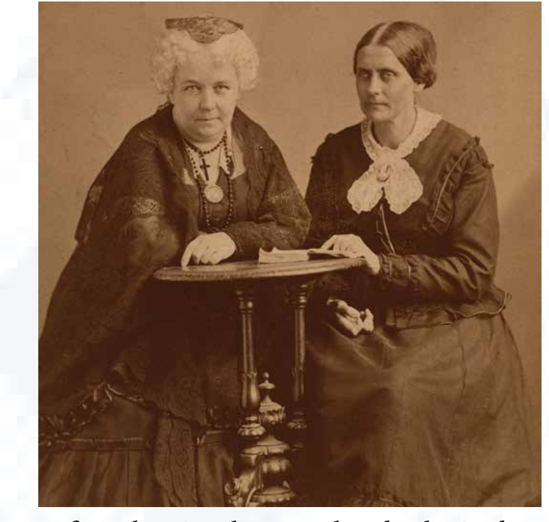
After the Civil War Elizabeth Cady Stanton and Susan B. Anthony, although dedicated abolitionists, objected to providing voting rights for black men if women's suffrage was not included. The issue split the suffragist movement. National Portrait Gallery