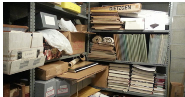
The Roving Archivist can help you gain intellectual and physical control of your materials

A Roving Archivist is a trained archival professional who is contracted by the MA SHRAB, through funding from the NHPRC, to provide assistance to institutions in Massachusetts. The Roving Archivist is available to provide advice on policies, procedures, arrangement and description of records, preservation planning and emergency preparedness. For more information on the Roving Archivist program, visit the MA SHRAB website at http://www.sec.state.ma.us/arc/arcskrab/shrabidx.htm .