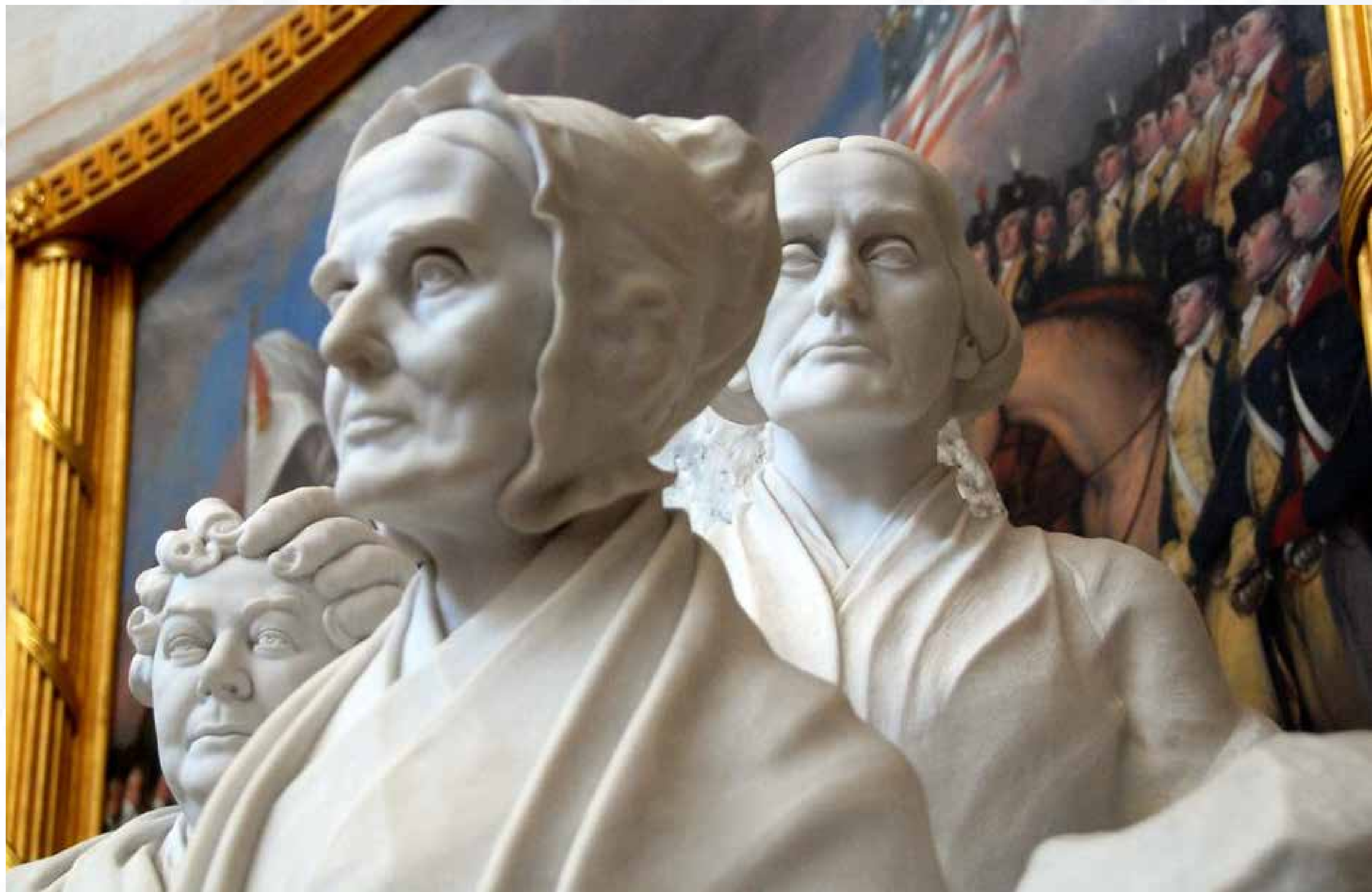
The "Portrait Monument" by Adelaide Johnson

In the Rotunda of the United States Capitol, surrounded by sculptures of leading men in American history, an unfinished statue was displayed in 1921. It honored three women with Massachusetts connections who were instrumental in securing the vote for women, Elizabeth Cady Stanton, Lucretia Mott and Susan B. Anthony. The statue was unfinished by design, perhaps signifying an unfinished agenda, perhaps leaving room someday for the first woman President.