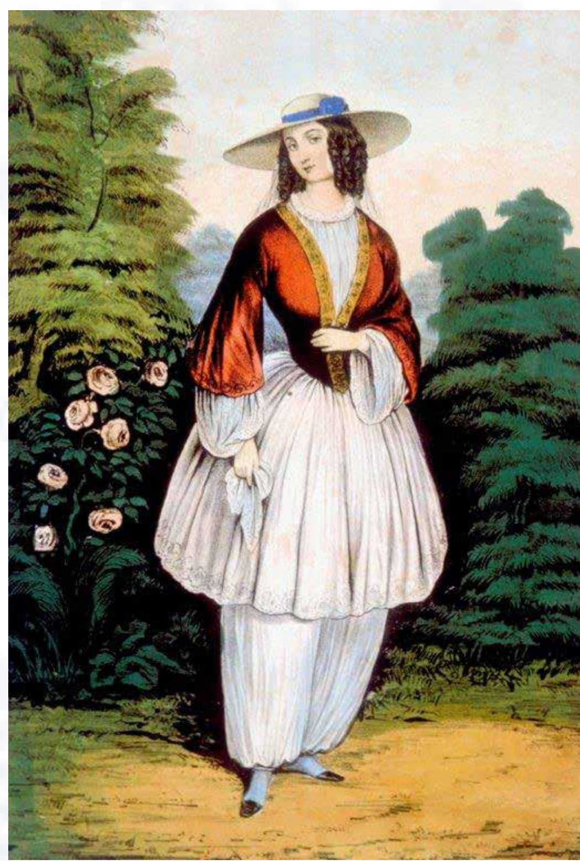
In the nineteenth century many thought that the “bloomer costume” was immodest.