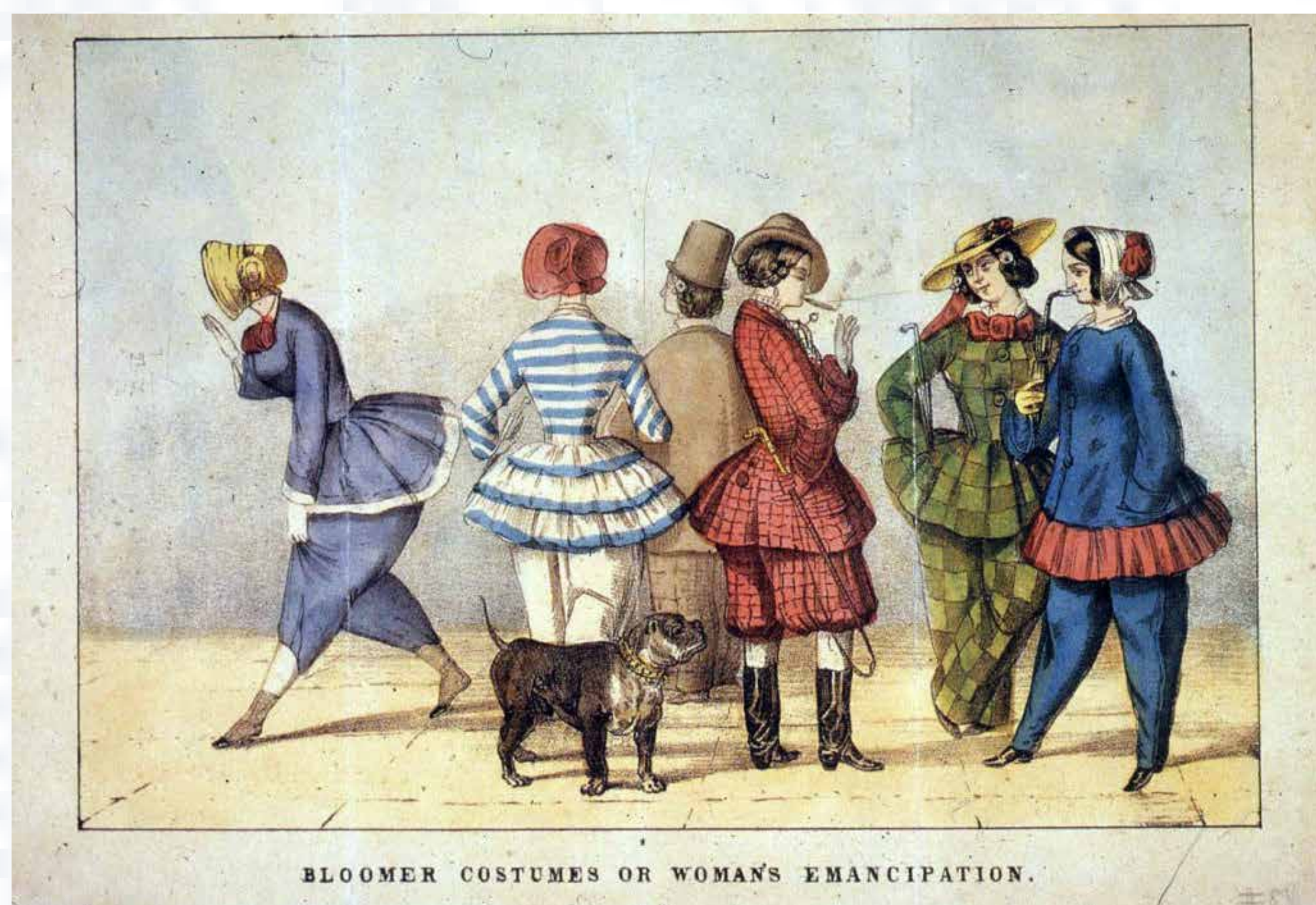
Cartoonists found an eager audience when satirizing the bloomer costume. Women in bloomers were portrayed as “mannish,” smoking cigars and pipes, or displaying aggressive “unladylike” behavior.

She published her own newspaper “The Lily” advocating temperance. (The effects of alcohol abuse on the family were an important concern for many activists.) Elizabeth Cady Stanton persuaded her to take a wider view, promoting suffrage and women’s issues generally. Amelia Bloomer’s advocacy of the “bloomer” costume increased circulation of The Lily and made her name a household word.