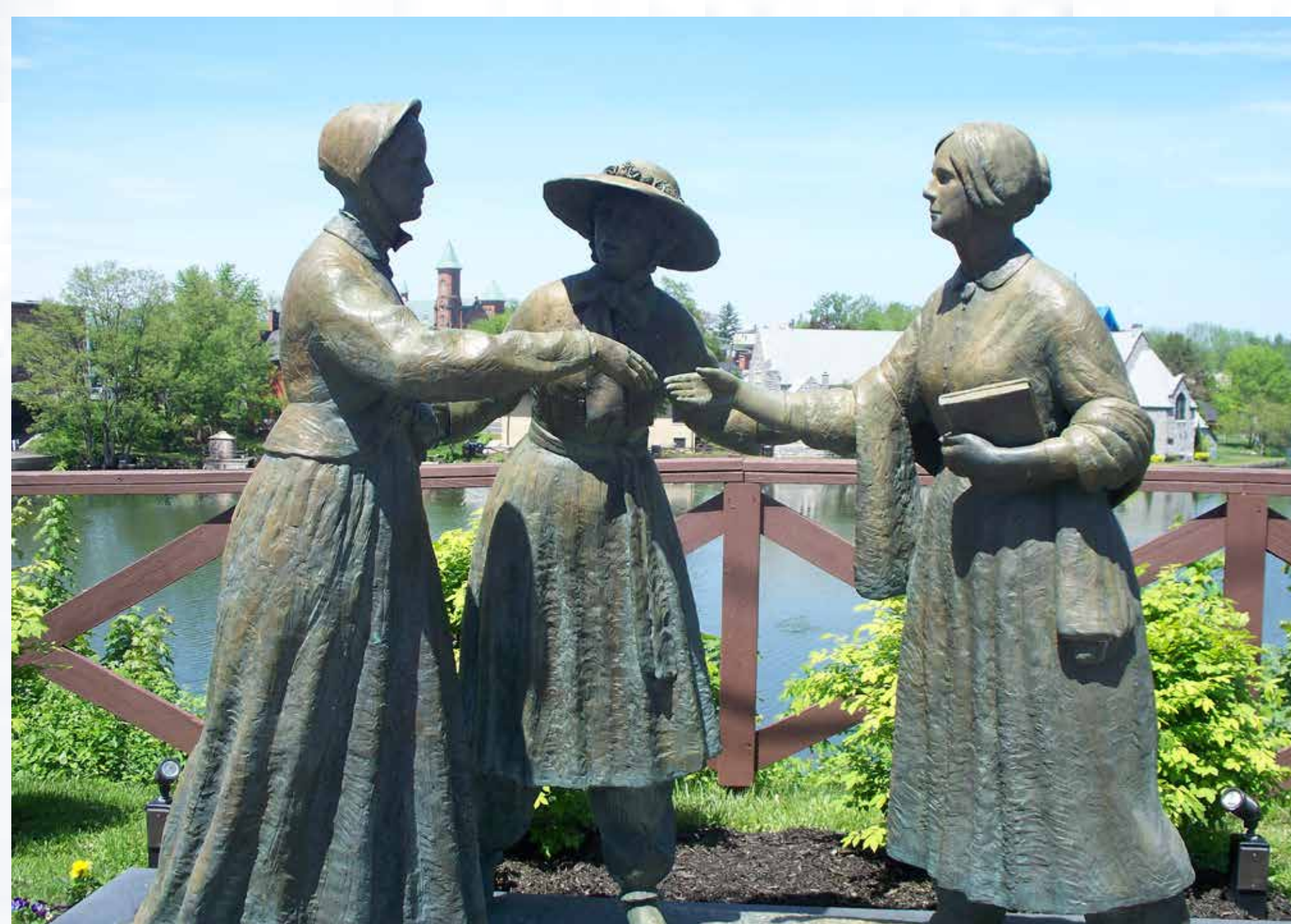
In 1851 Amelia Bloomer introduced Elizabeth Cady Stanton to Susan B. Anthony in Seneca Falls, New York. This historic meeting is commemorated by a statue which can be visited at the Women’s Rights National Historical Park.