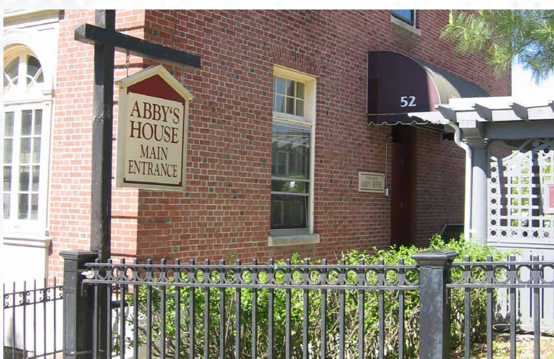
Worcester honors the legacy of Abby Kelley Foster with charter schools as well as a shelter and supportive housing program for women that bear her name.