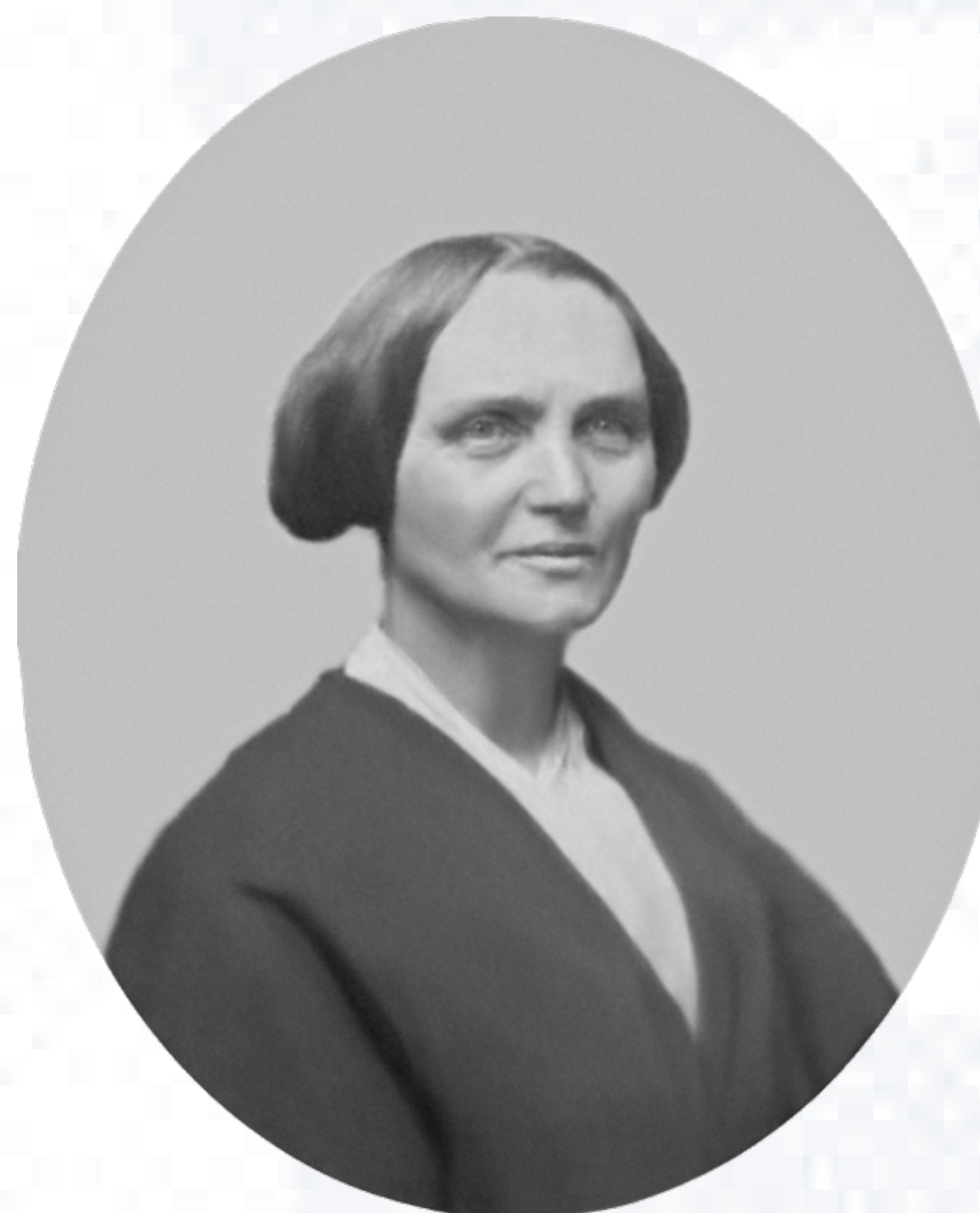
Abby Kelley Foster

A provocative speaker and talented organizer, Abby Kelley went to Ohio to spread the anti-slavery message. Appearing at Oberlin village in 1846, she inspired a Massachusetts student at the local college – Lucy Stone – who would later take to the lecture circuit for abolitionism and women's rights. After the Civil War she urged Stone to support voting rights for black men if women's suffrage was out of reach, believing opposition would be an act of “monstrous selfishness.”