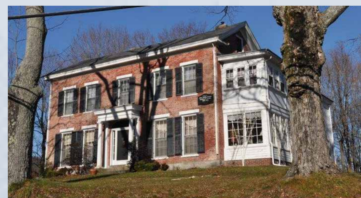
“Liberty Farm,” the home of Abby Kelley Foster

The home of Abby Kelley Foster and Stephen Symonds Foster became a stop on the Underground Railroad. Later the couple refused to pay property taxes because this amounted to “taxation without representation” for women. The home was seized and bought back at a financial loss.