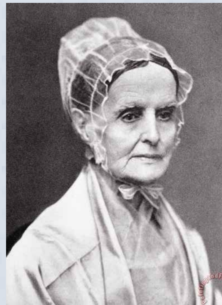
Lucretia Mott became a mentor and inspiration to the younger Cady Stanton.