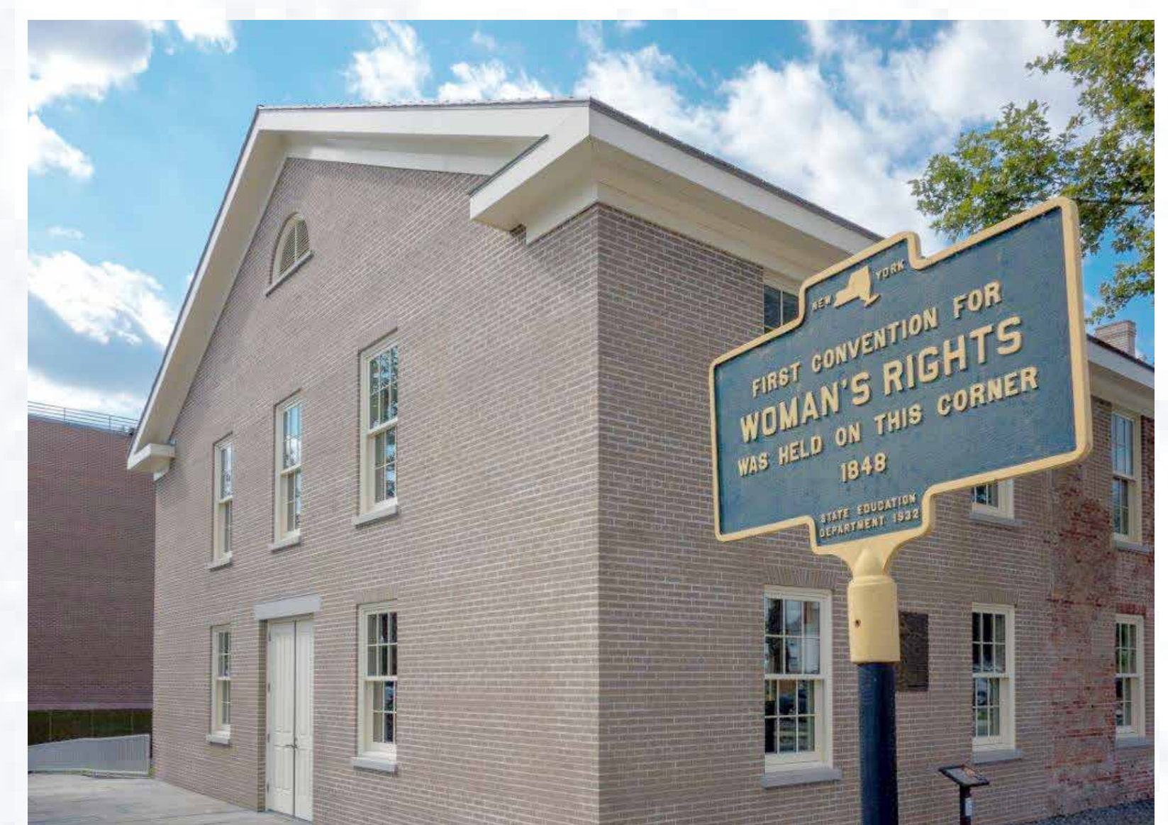
The original Wesleyan Chapel has not survived. This building, on the site, houses a museum dedicated to the Seneca Falls convention and women's history.