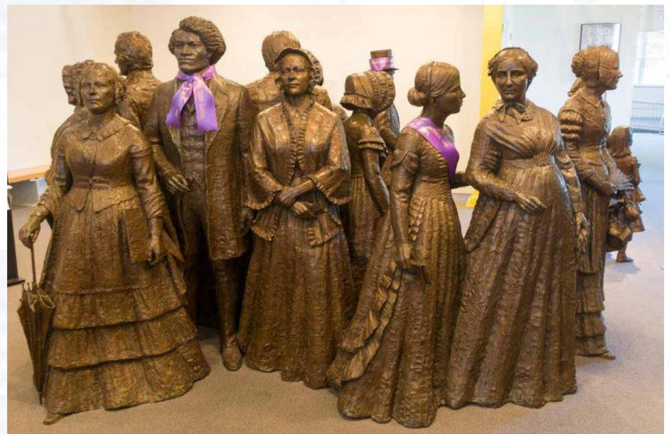
History imagined: Elizabeth Cady Stanton, Lucretia Mott and Frederick Douglass at the convention site.