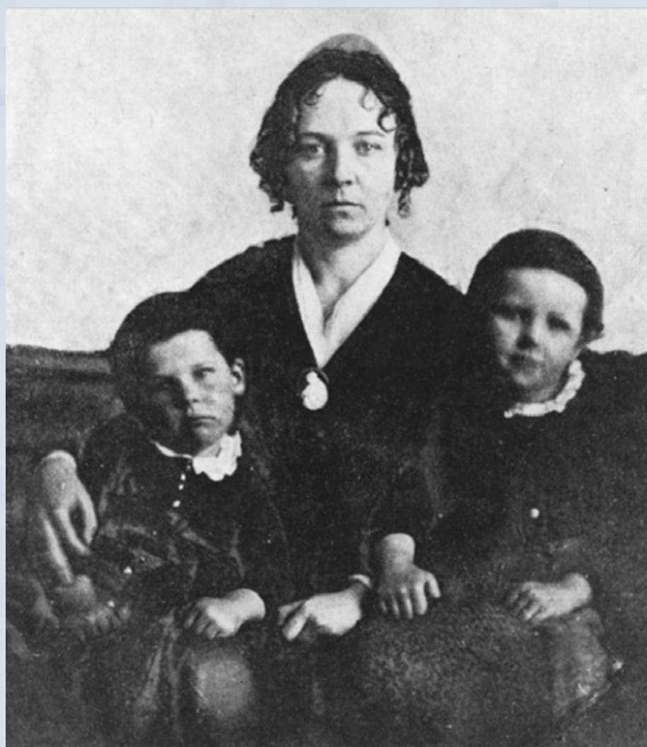
Elizabeth Cady Stanton around the time of the Seneca Falls Convention.

British abolitionists issued an invitation to "friends of the slave in every nation" for a World Anti-Slavery Convention. An American delegation included Elizabeth Cady Stanton—on her honeymoon—and Quaker activist Lucretia Mott. Women were seated separately and William Lloyd Garrison sat with them in protest. Shocked at the "narrow minded bigotry" of celebrated reformers, Cady Stanton made women's rights a life-long priority.