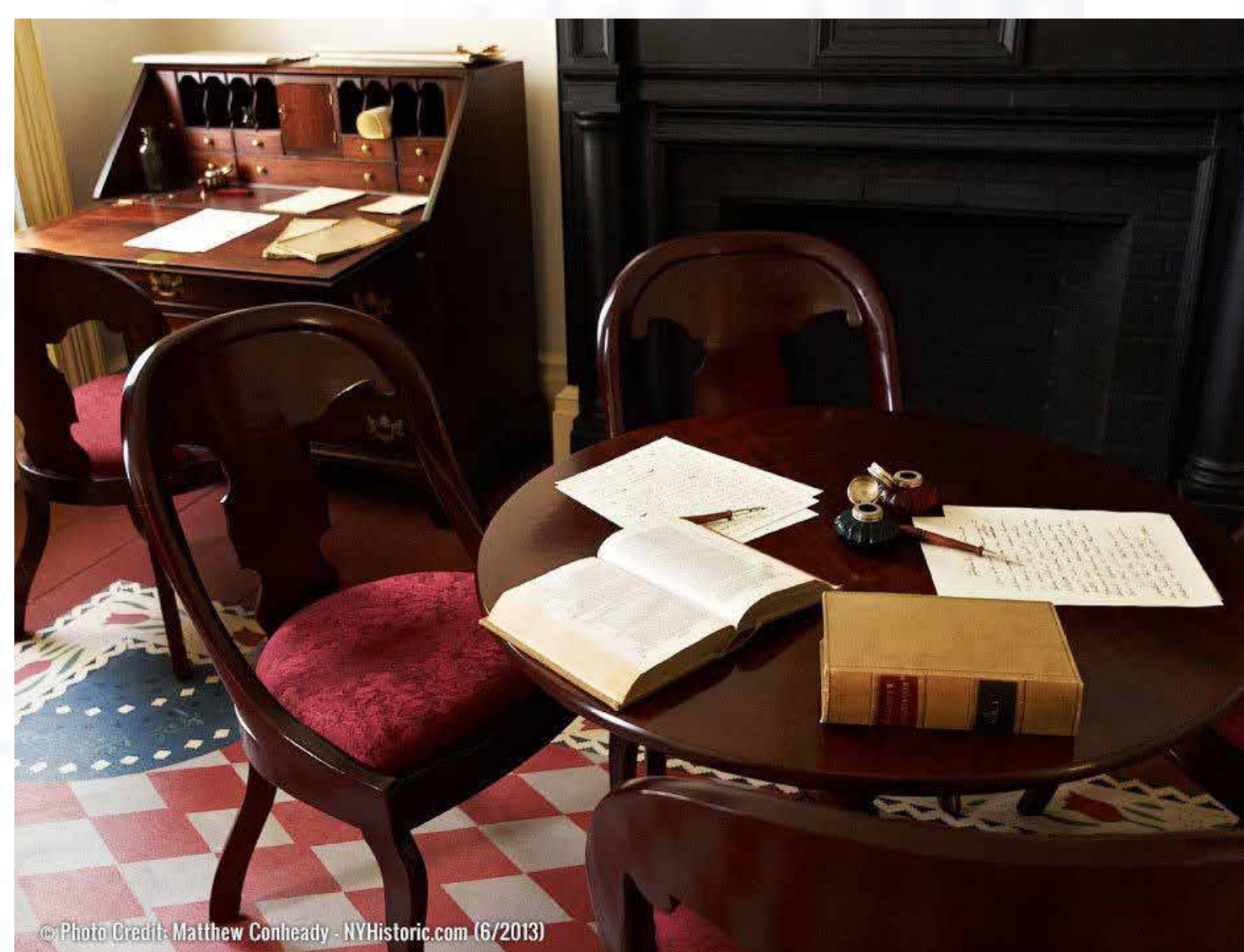
Elizabeth Cady Stanton drafted the Declaration of Sentiments in the McClintock house parlor in Waterloo, NY. Modeled on the Declaration of Independence it declared that "All men and women are created equal." The original table is now at the Smithsonian Institution. NEW YORK HISTORIC