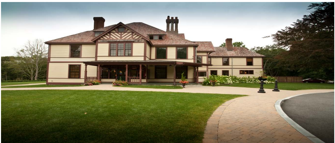
Once threatened with demolition, Highfield Hall in Falmouth received an MHC Preservation Award in 2010.

Fiscal Year 2010 – October 1, 2009 to September 30, 2010