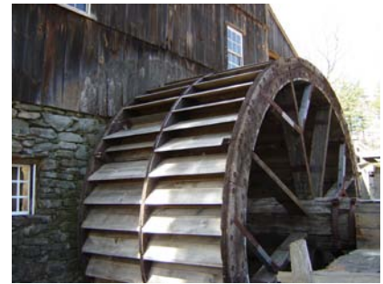
Old Sturbridge Village

Local Historic Districts on Beacon Hill and Nantucket are established as the first local historic districts in Massachusetts.