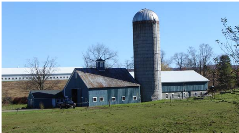
Agricultural land located in the town of Gill

Between 2002 and 2007, the number of farms and farm revenue increased dramatically in Massachusetts, up over twenty seven percent. Amazingly, there was no net loss of farmland