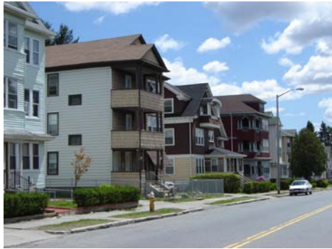
Multi-family housing in the City of Worcester

The majority of residents of Massachusetts live in urban areas. In many ways, the future of