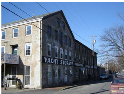
Maritime resources in Fairhaven

Every year, MHC evaluates some 110-120 properties for their National Register eligibility. And every year, MHC's NR staff reviews, processes, and moves toward completion on average about 35 nominations, while double that number comprise a backlog of nominations awaiting review,