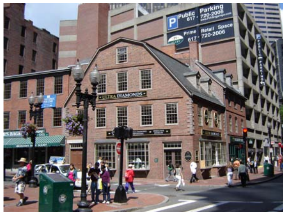
Old Corner Bookstore, Boston