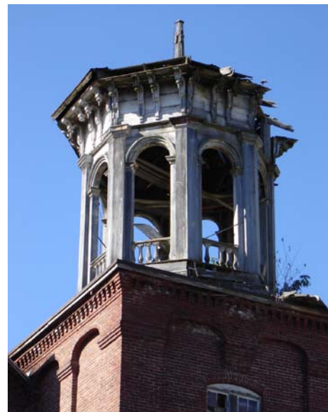
Financial challenges face many historic properties such as this mill building in the village of Gilbertville.

Funding challenges will also be present as recent past buildings from the 20 th Century age. Transitional masonry buildings consisting of structural steel frame, masonry walls, cast stone, and terra cotta are facing major deterioration and will require substantial investments in the coming years.