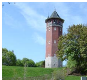
High Service Water Tower, Lawrence

Many of the same concerns noted for state property are also true for property owned by municipal government such as deferred maintenance, lack of funding, and disposition of surplus property.