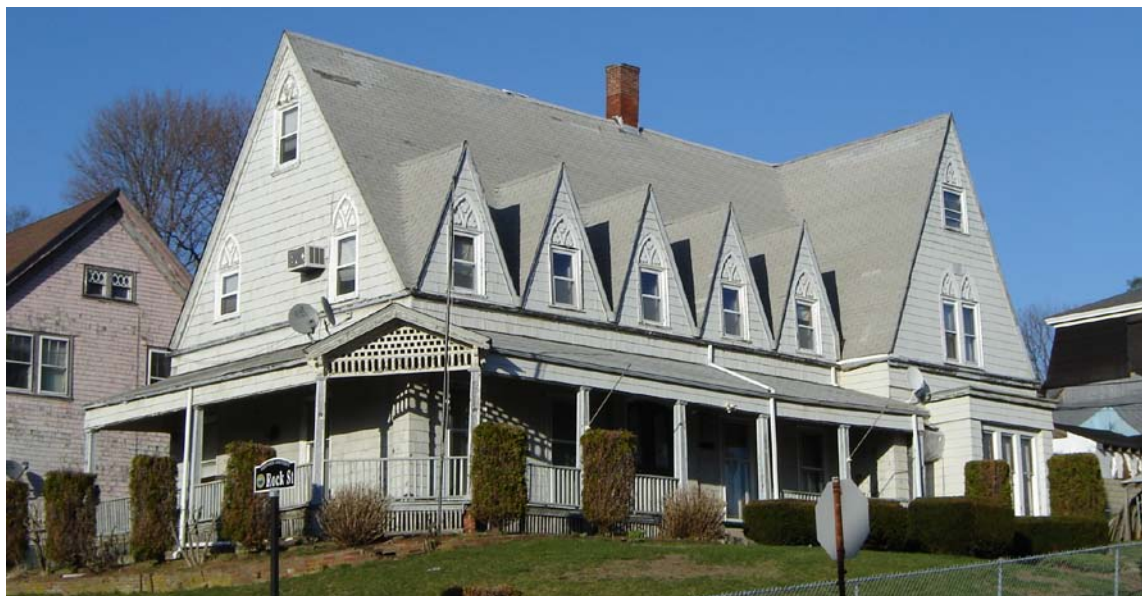
Highlands Historic District, Fall River