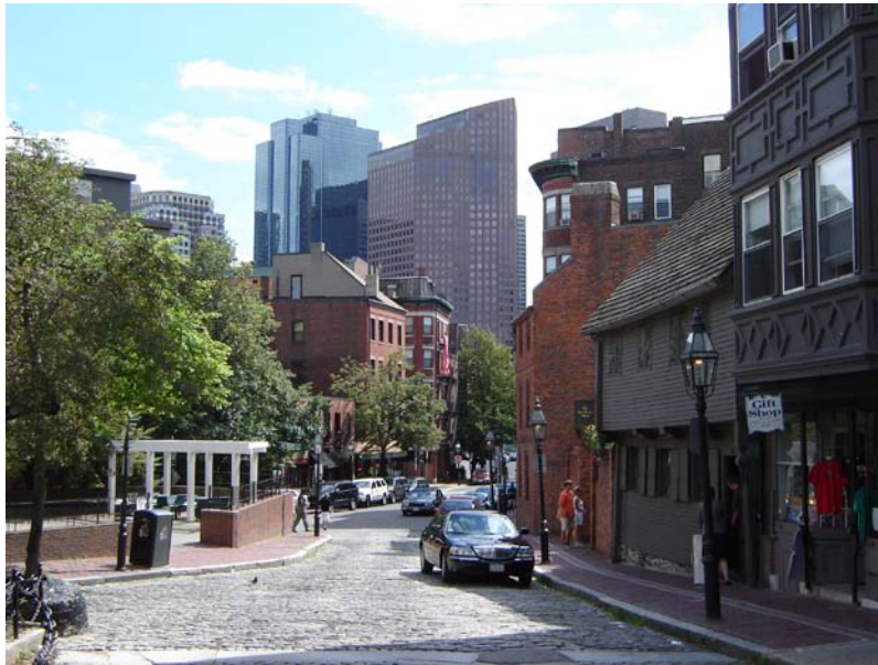
The Paul Revere House located in the North End, Boston

For over 10,000 years, human activity has shaped the landscape of this Commonwealth. Today, this landscape has stories to tell everywhere we look. Whether they are archaeological sites associated with Native American inhabitants, wood framed structures from early European settlement or factory villages adjacent to water powered sites, the landscapes of Massachusetts offer variety and interest that enhance the quality of life for residents and visitors alike. Today, the Massachusetts landscape is multi-layered as human activity on the landscape has shifted and shifted again.