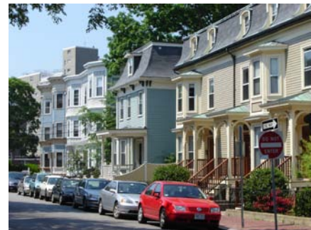
Neighborhood Conservation District, Cambridge

City of Cambridge establishes the first demolition delay ordinance.