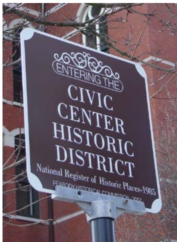
Civic Center National Register District, Peabody

The Inventory of Historic and Archaeological Assets of the Commonwealth has been compiled and maintained by the MHC since MHC's creation in 1963 and has grown to include records on an estimated 200,000 properties and sites. The inventory includes buildings, structures, sites,