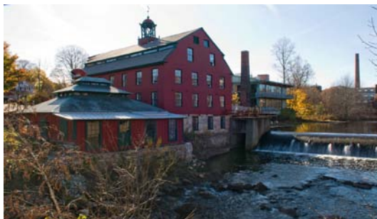
The Whitin Mill complex in Northbridge was the recipient of an MHC Preservation Award.

Lowell, Salem, and Nantucket actively using plaque programs to recognize historic preservation activities, increase owner appreciation and educate visitors.