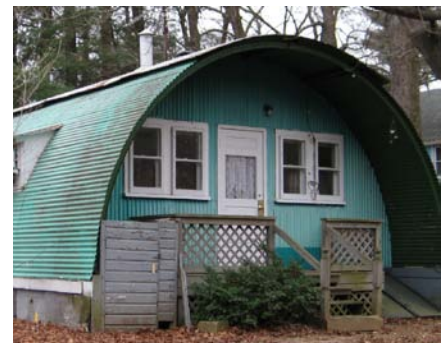
This unique WWII veterans housing was demolished in 2010 despite the advocacy efforts to preserve it.

An impressive number of communities established a demolition delay bylaw over the past five years. Yet, there remain 224 cities and towns without this basic level of regulatory protection. Additionally, most demolition delay bylaws remain at only six months. This is often an inadequate period of time to seek alternatives to demolition.