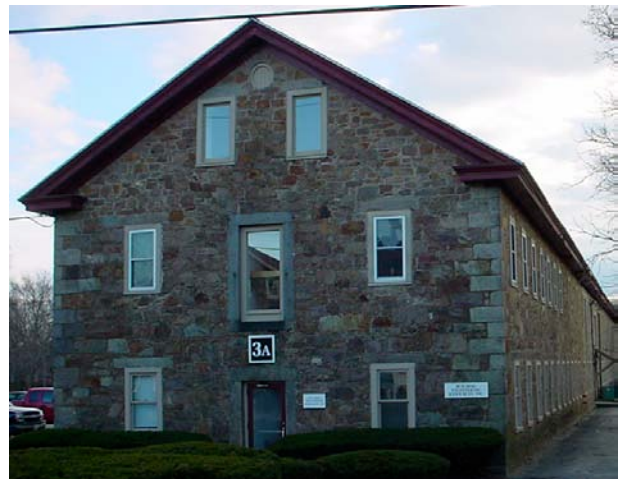
The Ames Shovel Shop in Easton

Over 60 communities have a historical plaque program with many communities such as