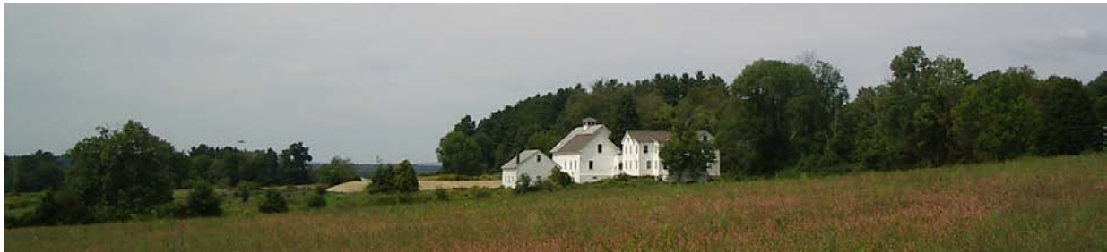
Historic agricultural landscape in Groton protected through community preservation act funds.

Since its passage in 2000, 147 communities have adopted the Community Preservation Act. The CPA is a local option state law that helps communities preserve their open spaces and historic sites, create affordable housing, and develop outdoor recreational facilities. CPA allows