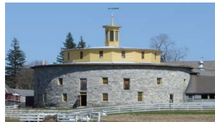
Shaker Village, Hancock

There are numerous challenges regarding heritage tourism particularly during the economic downturn. The state budget crisis has greatly impacted the funding available to draw visitors to Massachusetts. In many cases, state funding for visitor centers has been eliminated. All of the Visitor Centers on the Massachusetts Turnpike have been closed. Publication of the Getaway Guide magazine has ceased. Additionally, grants that encourage visitation to area attractions have declined or been eliminated. At the same time, discretionary income has declined bringing fewer travels. Museums have noted that visitation by school groups has dropped off. All this could have long-lasting implications as the next generation will have less interest in historic preservation and heritage tourism sites face increased competition from other recreational venues.