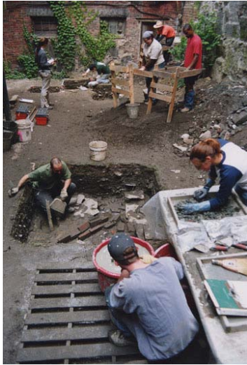
African Meeting House, Boston

projects MHC reviewed have not impacted significant historic resources. In cases where there is no feasible alternative to avoid a significant site, MHC has overseen archaeological data recovery efforts, which has resulted in the preservation of archaeological data and proper curation of artifacts and records. Data recovery efforts also include disseminating information to the public. An excellent example is the African Meeting House on Beacon Hill with its report, lectures, exhibit and MHC Archaeology Month poster for 2006.