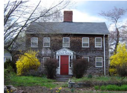
Threatened with demolition, the significance of the Fowler-Clark House, Boston was recognized during the demolition delay period.

As the survey and planning grant program was largely limited to certified local governments, interest in the program grew. Many communities inquired about the process of becoming a certified local government. The town of Lexington submitted the application material and became a Certified Local Government in 2009.