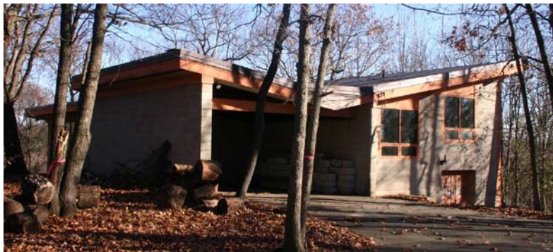
An example of modernist residential housing located in Lincoln

The resources of the mid 20 th century, including suburban neighborhoods, commercial, institutional, and civic structures, individual residences, and mid 20 th century landscapes are among the region's least appreciated and most threatened historic resources. Expressions of