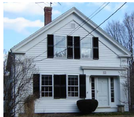
Leverett Center National Register District listed in 2008.

The number of nominations completed and properties listed in the NR diminished since the publication of the last State Plan, but there were nevertheless a number of major achievements. More than 165 nominations were completed, documenting the significance of