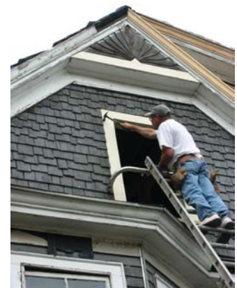
A window removed for rehabilitation in Somerville.

Often unrecognized are the many public and privately owned historic resources where stewardship is ongoing and where annual funding is allocated for proper maintenance. Whether it is a municipality diligently maintaining their town hall year after year, a homeowner reglazing a wood window, or one of the thousands of historic property owners statewide with a plan in