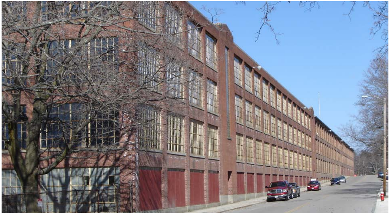
Draper Mill, Hopedale

The next periodic revision and update of the State Historic Preservation Plan is scheduled to begin late in 2014.