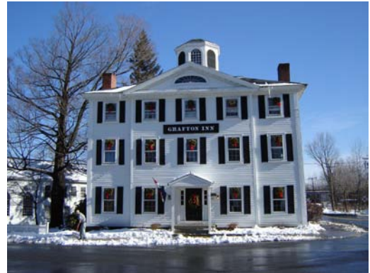
The village center of Grafton located in the Blackstone River Valley.

The Massachusetts Historical Commission promulgates new State Register review regulations.