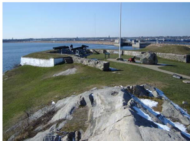
Fort Phoenix, Fairhaven

Only a very small percentage of the state has been subjected to an archaeological survey. As a result, perhaps only 3-5% of the number of archaeological sites expected to exist are recorded in MHC's inventory. Given the lack of systematic archaeological survey across the state, identification surveys are a priority planning activity.