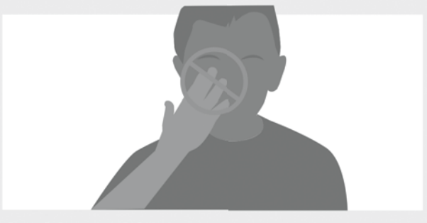
Avoid touching your eyes, nose and mouth.