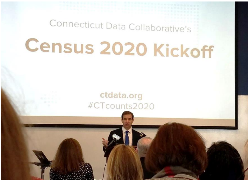
Hartford Mayor, Luke Bronin