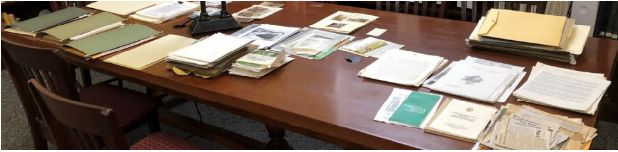
Archival Field Fellowships bring together emerging archival professionals and cultural heritage institutions to process archival collections