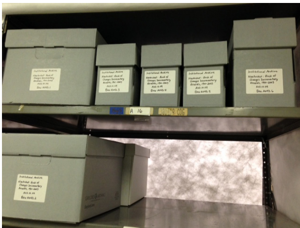
Archival Field Fellowship at the Museum of African American History

The SHRAB operates under the provisions of federal regulations to serve as the state-level review body for proposals submitted to the National Historical Publications and Records Commission (NHPRC) grant program. It also serves as the Archives Advisory Commission (AAC) for the Commonwealth. The Secretary of the Commonwealth and the Governor appoint volunteer Board members in accordance with MGL Chapter 9 Section 2A.