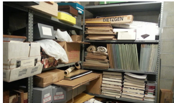
The Roving Archivist can help you gain intellectual and physical control of your materials

A Roving Archivist is a trained archival professional who is contracted by the MA SHRAB, through funding from the NHPRC, to provide assistance to institutions in Massachusetts. The Roving Archivist is available to provide advice on policies, procedures, arrangement and description of records, preservation planning and emergency preparedness. For more information on the Roving Archivist program, visit the MA SHRAB website at www.sec.state.ma.us/arc/arcshrab/shrabidx.htm .